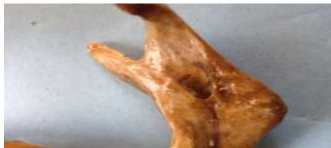
Fig.6 Nodular (a less prominent lingula)