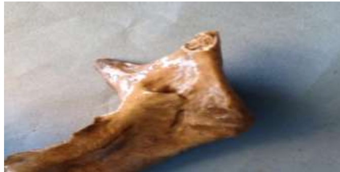
Fig.3. truncated with a clear upper border