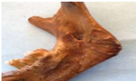
Fig.1. Triangular with only an anterior border