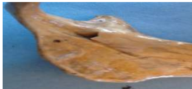
Fig.4. Truncated with a notch on the upper border