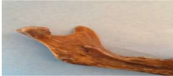
Fig.2. Typical triangular with apex, anterior and posterior borders